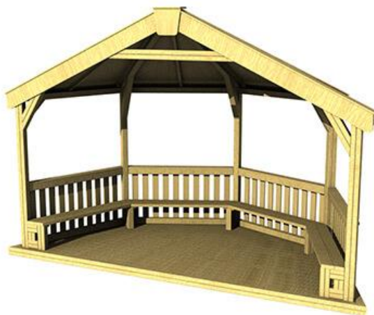
Planned New Parents Shelter

We also have a parent's shelter and outdoor classroom being constructed over the holiday period. This was possible due to a parent recommending the school to the Thompson Family Charitable Trust that has donated £10,000 and school fund contributing the remainder.