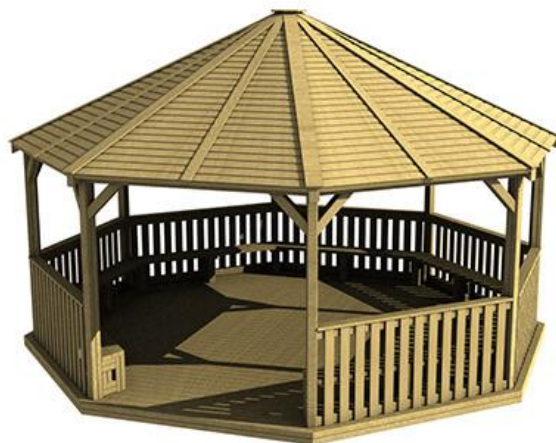
Planned New Outdoor Classroom