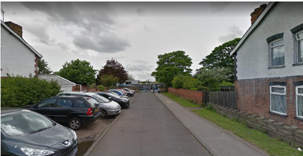
Queensbury School Driveway