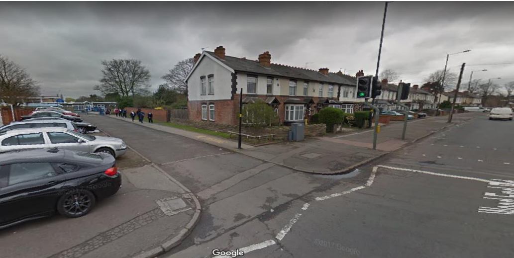
Queensbury School Main Entrance